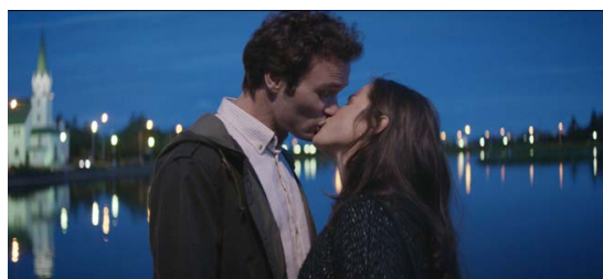
IN FRONT OF OTHERS by Óskar Jónasson